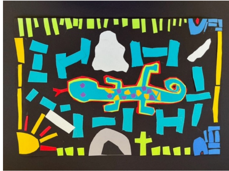
Student art work from Willard School .