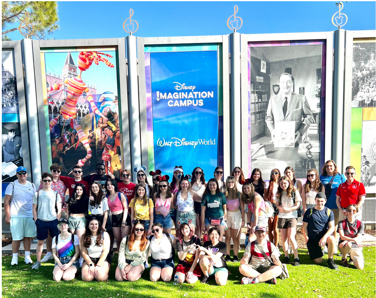
BHS Chorus Students participated in a Walt Disney World Imagination Campus SoundTracks Vocal Workshop in early April.