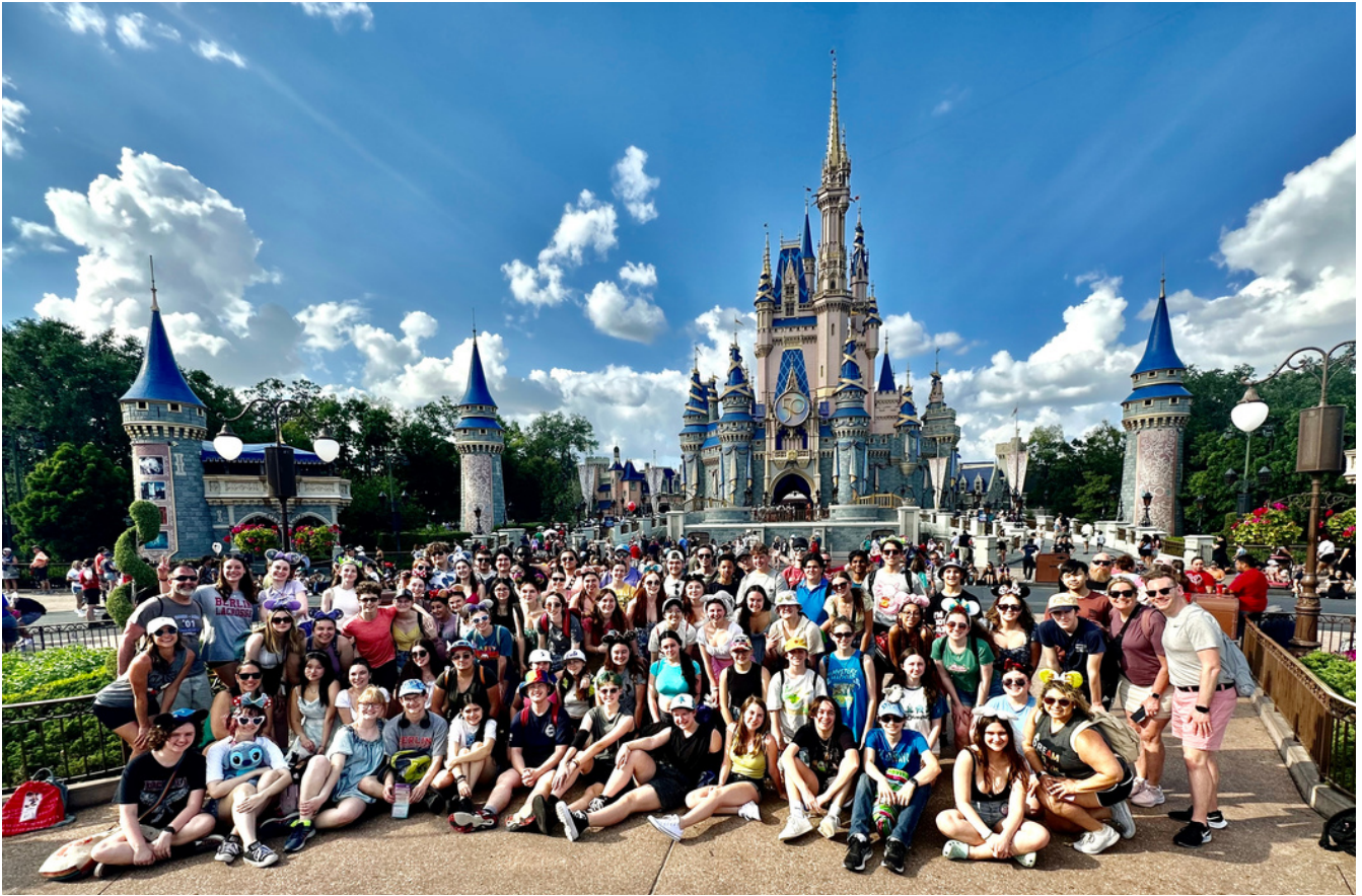
ABOVE: BHS Band & Chorus Students participated in Disney Performance Workshops in early April to learn about rehearsal & performance techniques from professional Disney Cast Members. BELOW: BHS delighted audiences with their production of Disney's "The Little Mermaid" in early March. More than 1,600 people came to the show!