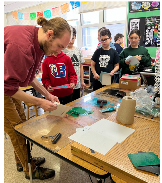
Griswold artists learn from local museum artists.