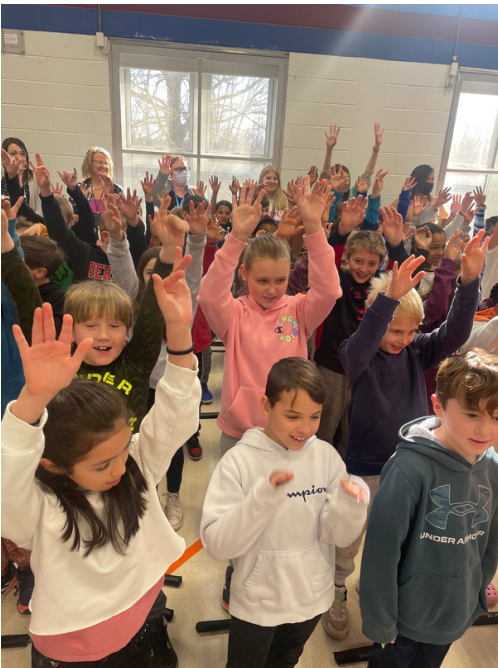
Griswold Students celebrate Music In Our Schools Month with a "Music In The Round" performance.